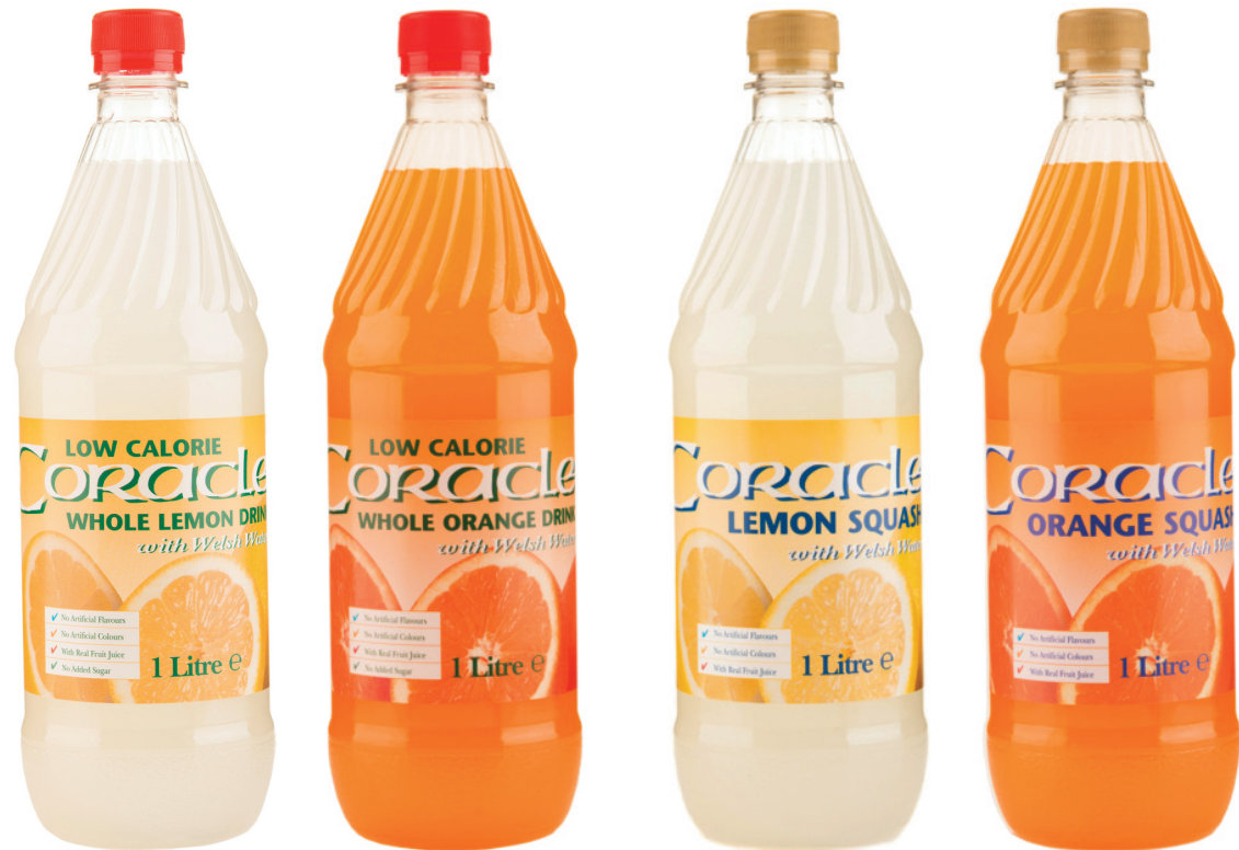
1 Litre Low Calorie Squashes