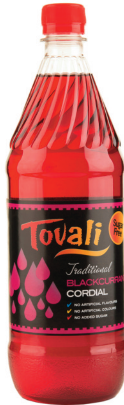
1 Litre Sugar Free Squashes & Cordials