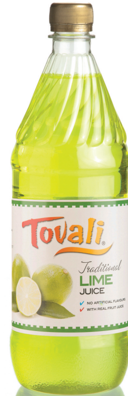
1 Litre Squashes & Cordials