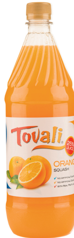
1 Litre Squashes (25% Fruit)